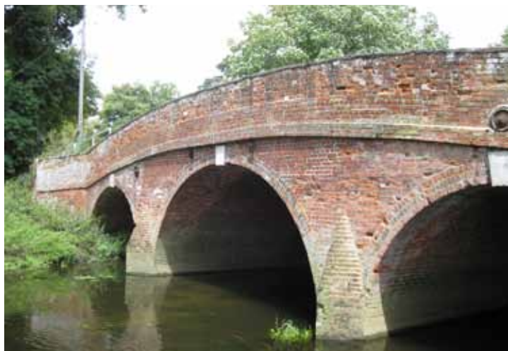
Fig J Station Road Bridge over the Blackwater River