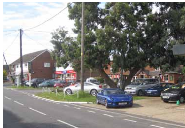
Fig H The Street