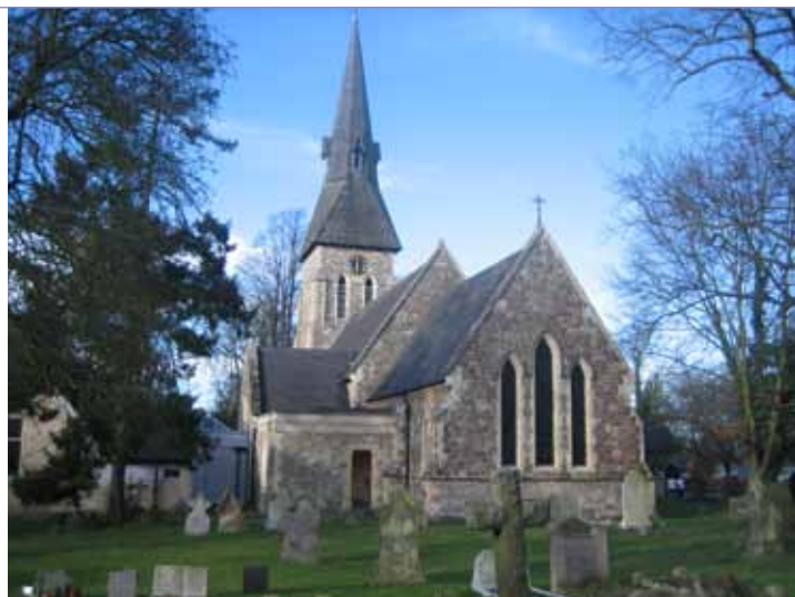
Fig M St Bartholomew's Church