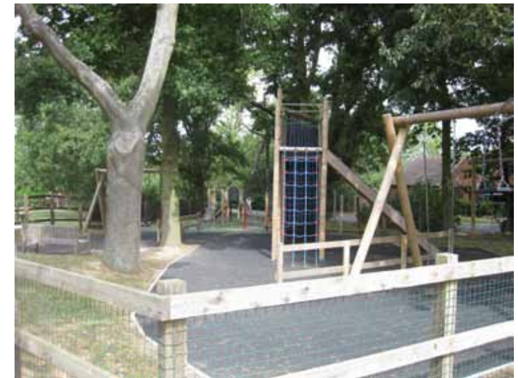
Fig O Childrens Playground