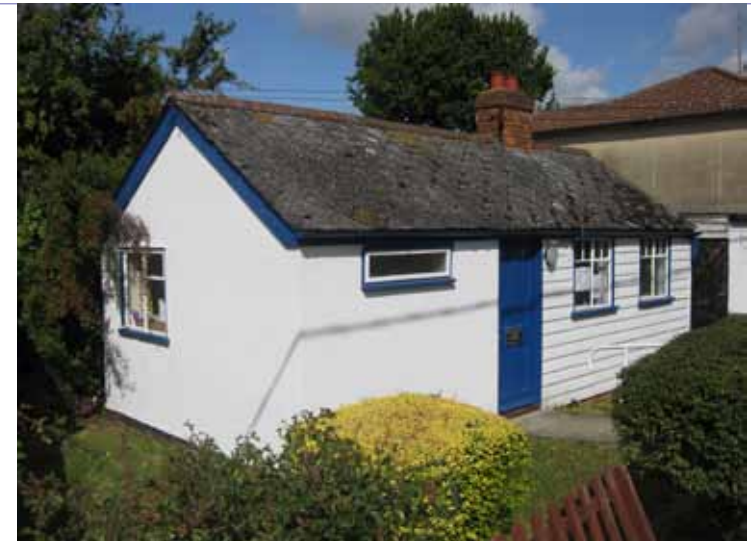
Fig K Doctors' Surgery

*The village questionnaire showed support for a small development of affordable housing, specifically designated for local people. A subsequent Housing Needs Survey conducted by the RCCE on behalf of the Parish Council also showed significant support for the building of such homes (64%), and the need identified in the returned forms led to the initial recommendation of 5 units, with a mixture of tenancy arrangements (rent, shared ownership, intermediate rent ). The Parish Council has agreed to take this forward, and will enter discussions with a number of Housing Associations.