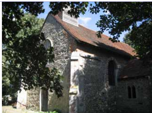
Fig E St Peter's Church