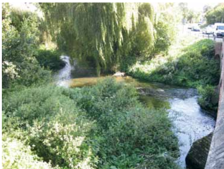
Fig P Blackwater at Blue Mills