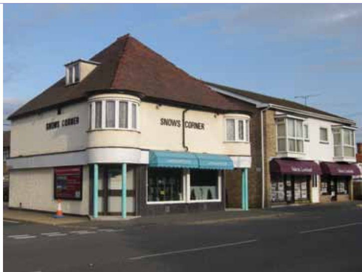
Fig I Arthur Mackmurdo Building