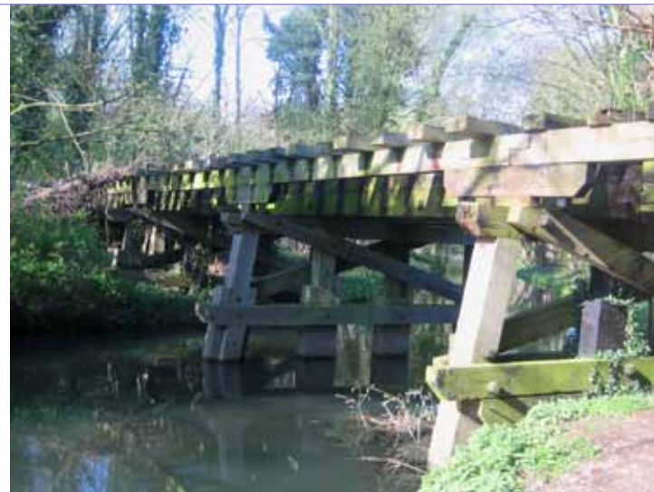
Fig G Timber Trestle Viaduct Monument

Engage with the Neighbourhood Watch and encourage a more timely dissemination of information. See General comment above.