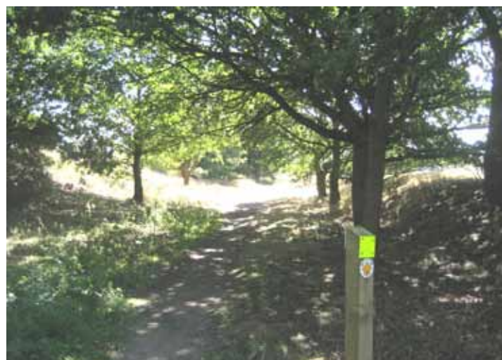
Fig D Blackwater Rail Trail