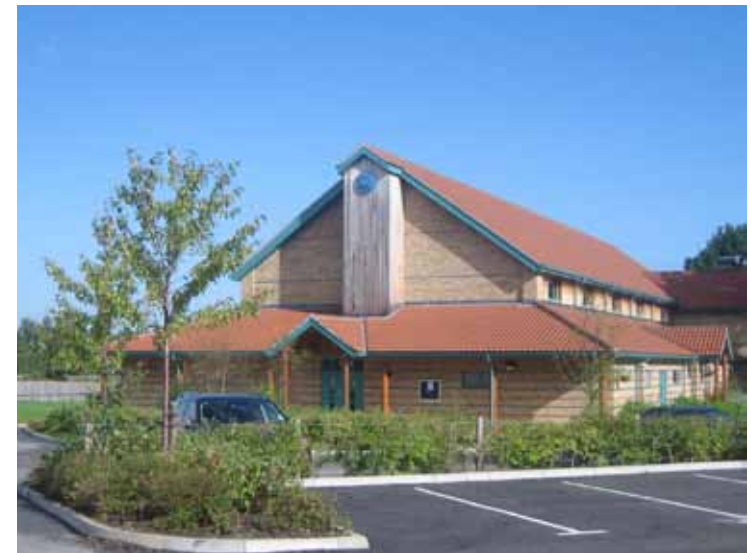
Fig L Village Hall