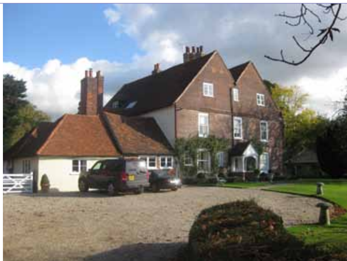
Fig C Wickham Hall