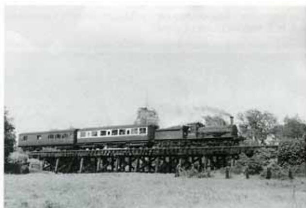
The Viaduct in use May 31st, 1958