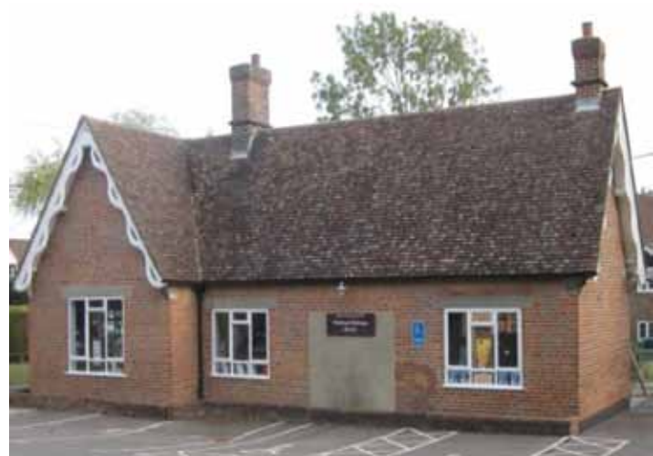
Fig N The Library