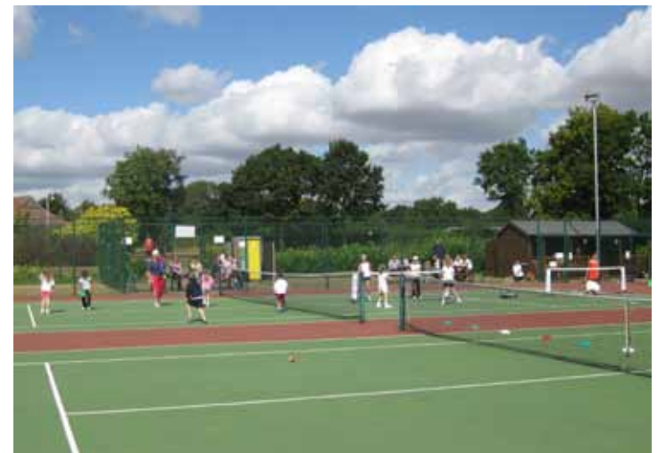
Fig B Tennis Courts at Sports Field