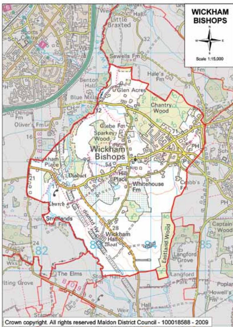
Map 1 – Parish Boundary