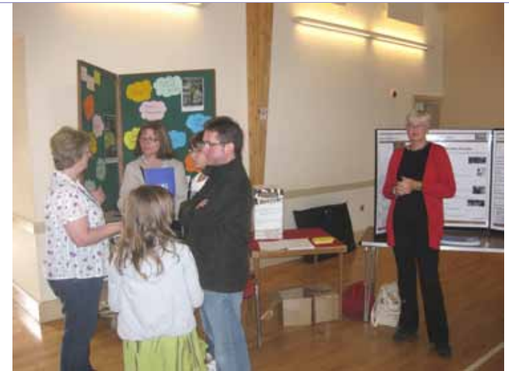
Fig A Exhibition Day

In polling opinions in the community we have had feedback from some people who whilst not in the parish consider themselves part of Wickham Bishops because they live close to our parish boundary. In particular, the Beacon Hill Sports Association (BHSA), which covers 4 parishes, is based in our Village Hall, (Fig L) and Sports Field, (Fig B). Although not included in the statistics, helpful views have been noted.