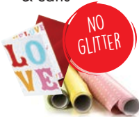
Greeting cards & wrapping paper