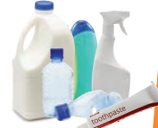
Plastic bottles (LEAVE LIDS ON) Toothpaste tubes

Where possible present cardboard inside your pink sack to keep it dry. Small amounts of empty cardboard boxes will be collected if they are all flattened and presented beside your pink sacks.