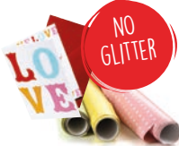
Greeting cards & wrapping paper