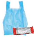
Plastic bags and wrappings

NO THANKS: Nappies, vapes, batteries, food, glass, wet wipes, hard plastic, polystyrene, food/food residue, wallpaper, takeaway cups, clothes, tissues, kitchen roll, PPE (disposable gloves, face masks)