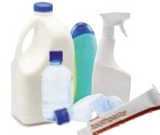
Plastic bottles (LEAVE LIDS ON) Toothpaste tubes